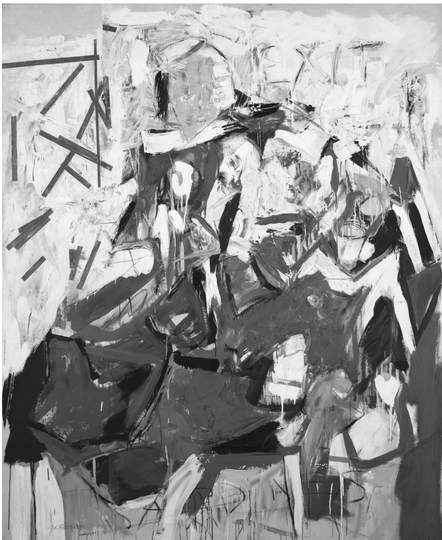
1. Michael Goldberg, Sardines (1955)

that are held in a perpetual dialogue with each other. In Goldberg's completed painting, now in the Smithsonian American Art Museum (Figure 1), the word 'SARDINES' is just about legible at the bottom while the word 'EXIT' – not mentioned in O'Hara's poem – appears at the top. The painting thus plays with the distinction between words and images, and between abstract and representational art. The same could be said of O'Hara's poem, which also describes the temporal process by which both visual and verbal art are created. The phrase