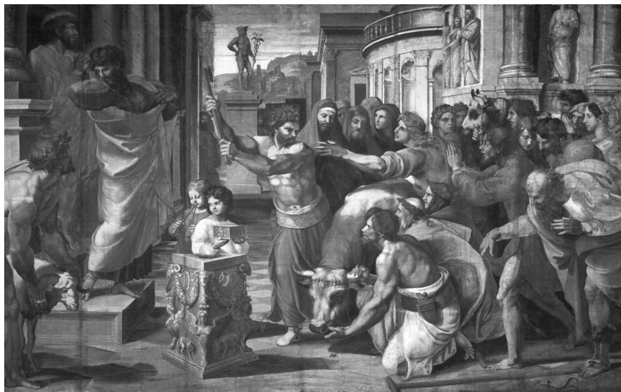
4. Raphael, The Sacrifice at Lystra (c. 1515–16)

between reading an image and reading a text, which is arguably the central theme of the 'Ode on a Grecian Urn'. Scott concludes his reading of the poem by suggesting that "The paragone appears to result in a draw" (p. 147); but his account arguably highlights the problems of the paragone as an interpretative model. As with many ekphrastic poems, the comparison that the speaker sets up between poetry and visual art is not a source of genuine anxiety but rather a literary and rhetorical device: it is one of several strategies that the poem uses to persuade us that the urn has a prior and independent existence outside the text.