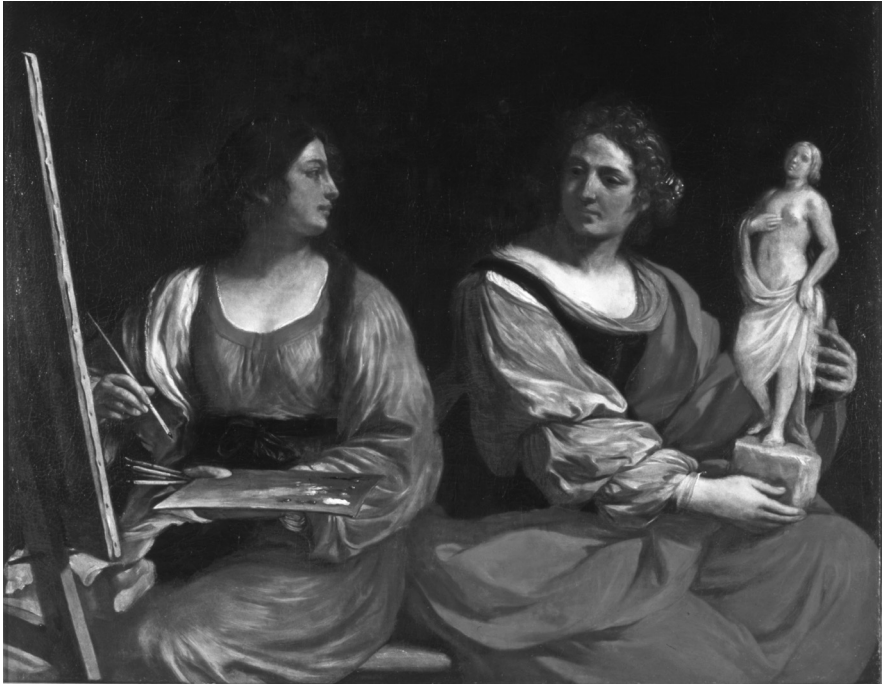
2. Guercino, Allegory of Painting and Sculpture (1637)