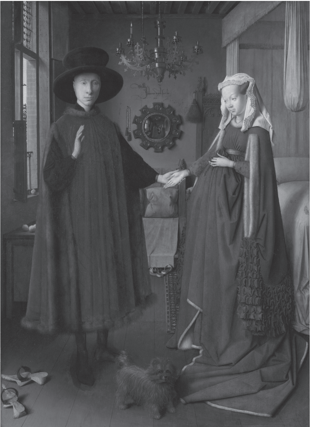
Figure 1. Jan van Eyck, Portrait of Giovanni [?] Arnolfini and His Wife , 1434, oil on oak, 82.2 cm × 60 cm