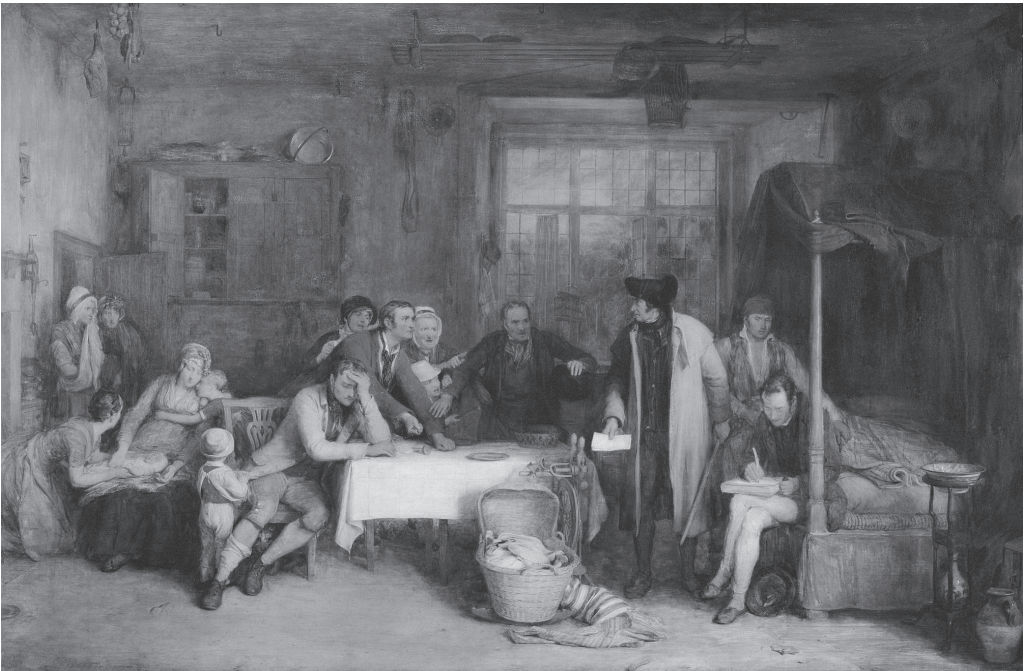
Figure 4. David Wilkie, Distraint for Rent , 1815, oil on panel, 81.3 cm × 123 cm