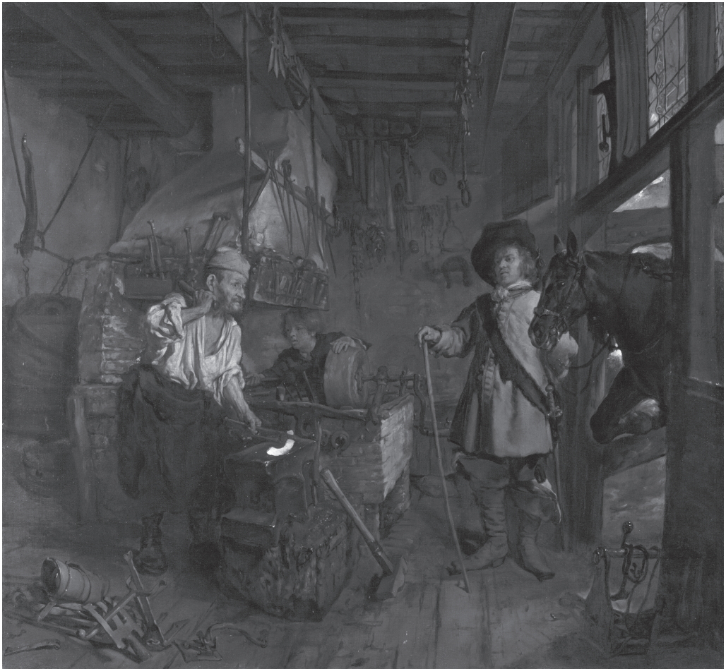
Figure 3. Gabriel Metsu, The Interior of a Smithy , c. 1657, oil on canvas, 65.4 cm × 73.3 cm

produced a plethora of images of the trades and professions and numerous scenes of domestic labour that centre on maids and cooks. 44 Bawdy compositions by Jan Steen and others update sixteenth-century kermis iconography to encompass the urban middle class as well as peasants and seem to have been conceived with a didactic end in mind. 45 What often appears to be an imagery ridiculing common vices of his own class in Steen's work contrasts with the sometimes darker and more bestialized imagery of Adriaen van Ostade, which is surely an index of class loathing. 46 The latter works register the increasing intolerance of 'idleness' and indigence and the perceived need for labour to be disciplined as Dutch society developed an increasingly capitalist ethos. 47 When labour is depicted, faces are usually hidden or averted from our look (Figure 3).