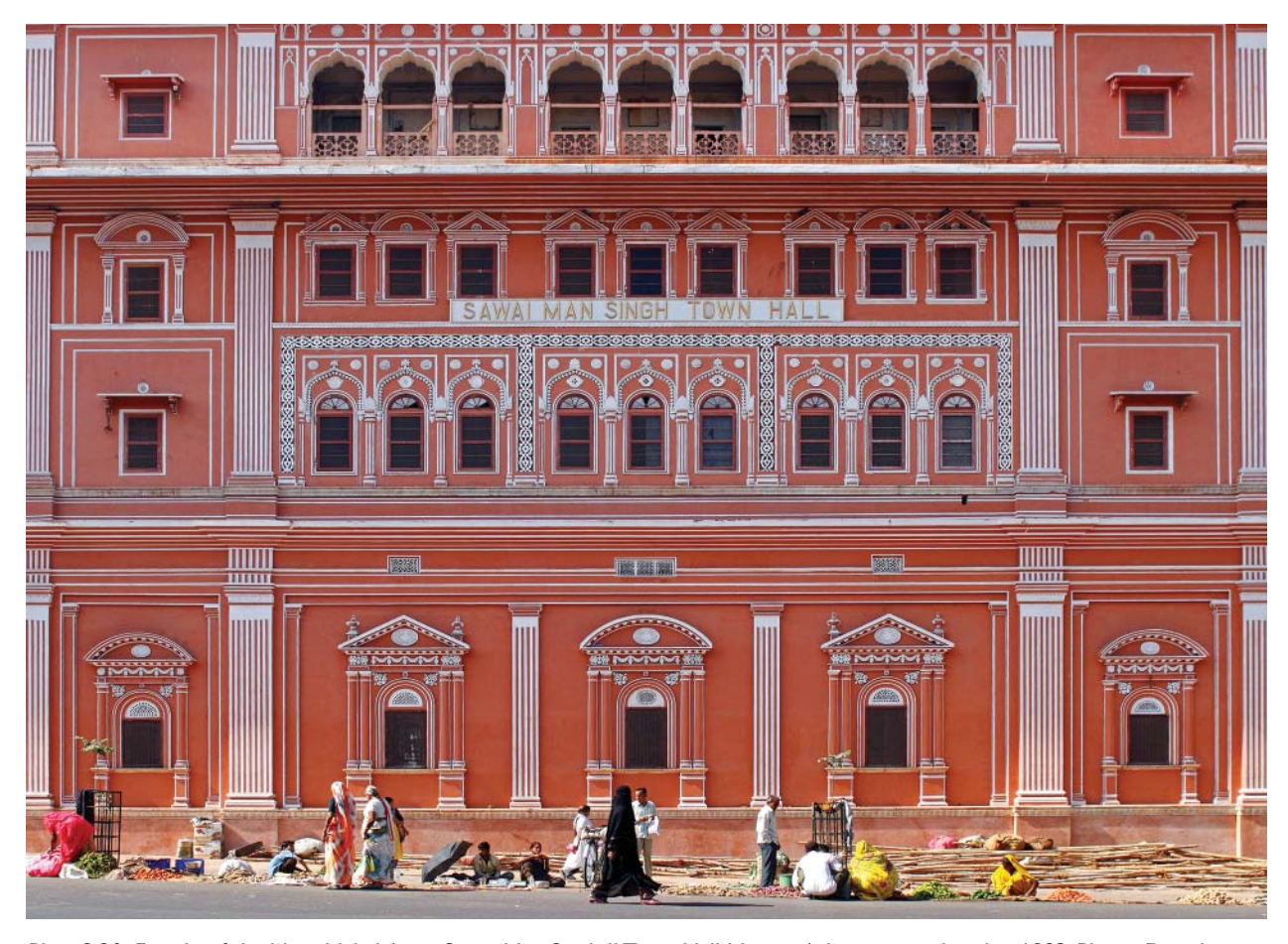
Plate 2.20 Façade of the Naya Mahal (now Sawai Man Singh II Town Hall Museum), Jaipur, completed in 1883.

as a deliberate attempt to present an alternative view of the cultural encounter between Britain and India. The middle section of the facade, for example, embraces cultural mixing, yet maintains the identity of both cultures. The plausibility of the reading is reinforced by the way that this section is framed by 'pure' European designs on the ground floor and the Indian architectural features on the top one. The whole façade might thus be read as presenting a critique of the European obsession with tradition and the purity of design in a way that defiantly asserts the Mughal practice of appropriating foreign features into Indian visual vocabulary, thus artistically reclaiming past Mughal power and greatness.