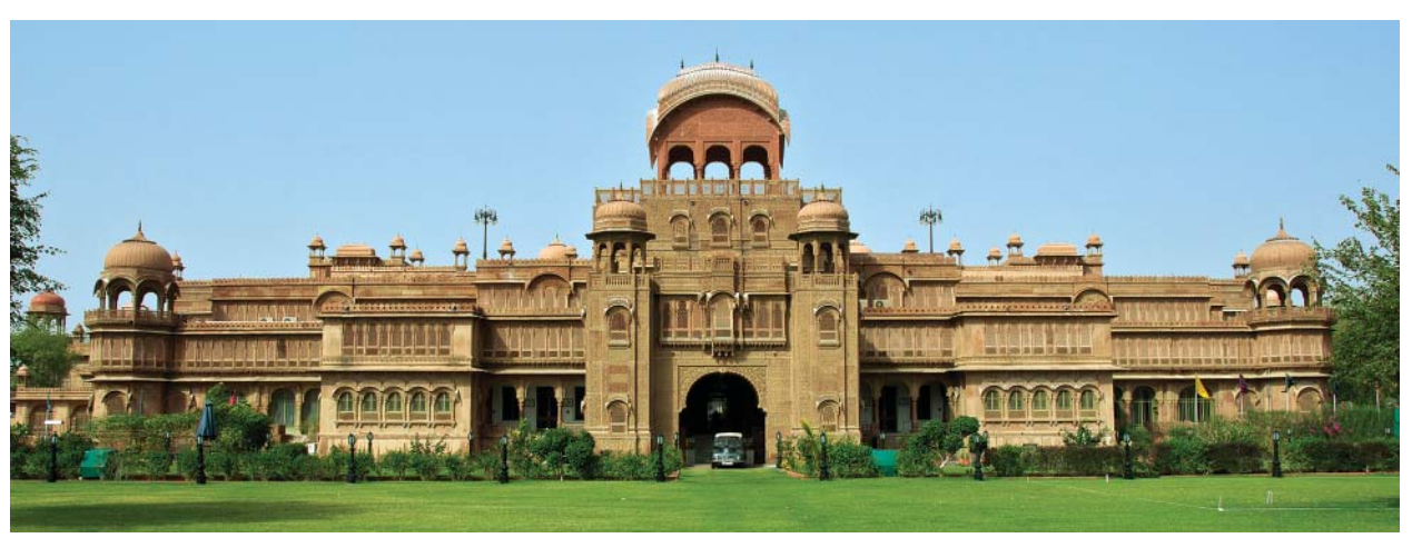
Plate 2.17 Sir Samuel Swinton Jacob, Lallgarh Palace (now the Laxmi Niwas Palace Hotel), 1902–26, Bikaner, India.

from buildings in and around the city of Jaipur, as well as nearby Mughal monuments in Agra, Fatehpur Sikri and Delhi. They were drawn by Indian draughtsmen attached to Jacob's department whom he instructed to document designs of local buildings with the aim of ensuring that the Albert Hall Museum was based on examples of regional architecture.