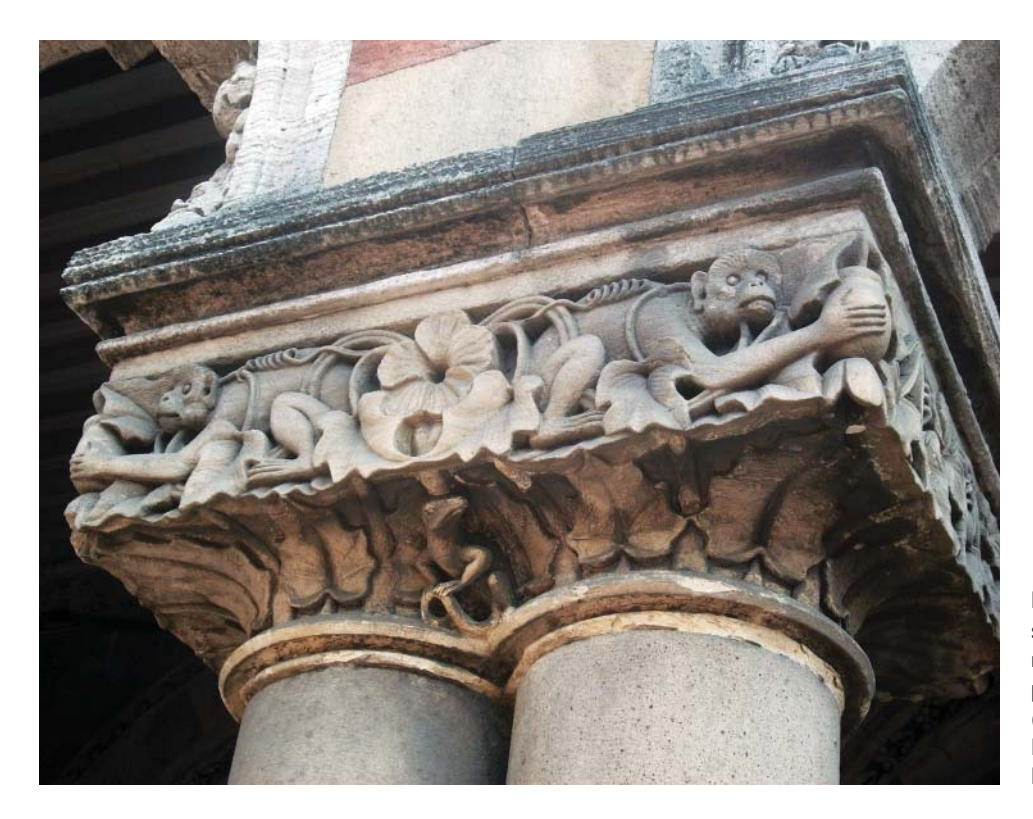
Plate 2.16 Carved stonework detail with monkey, lizard and local plants, Victoria Terminus (now Chhatrapati Shivaji Maharaj Terminus), Bombay.