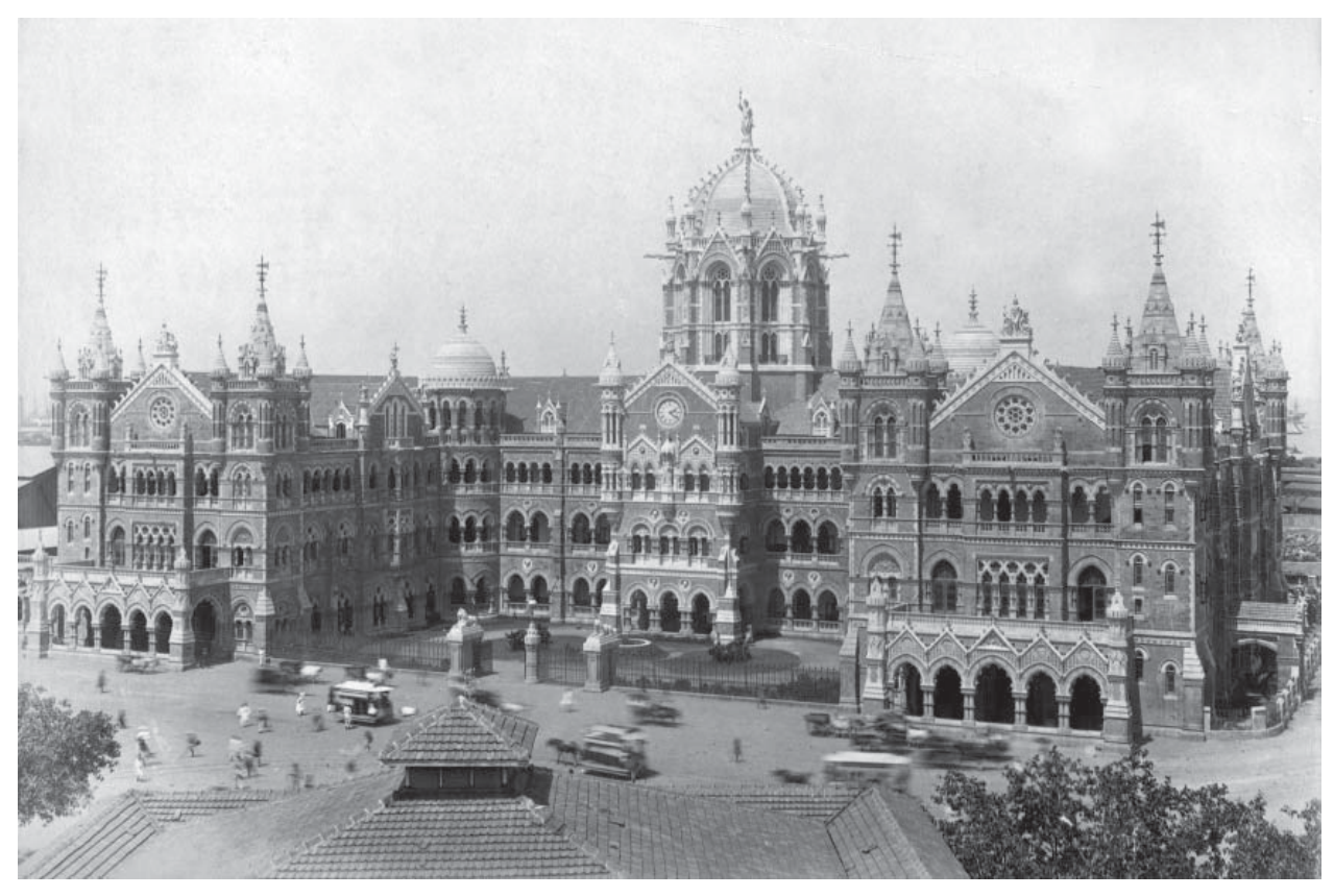
Plate 2.14 Victoria Terminus (now Chhatrapati Shivaji Maharaj Terminus), c.1887–90, albumen print, Taurines Studio.

The other major Anglo-Indian architectural style, known as the Indo-Saracenic, was based on Indo-Islamic architecture, which derived from Persia (now Iran), Afghanistan and central Asia as well as regional Indian traditions. The label by which the style is known is thus a misnomer, since the word 'Saracenic' derives from Europe's encounter with the Arabs in the Middle Ages, whether in the eastern Mediterranean or Islamic Spain, and disregards the cultural differences between Indo-Islamic and Mediterranean Islamic cultures. It will, however, be used here, in accordance with the usage at the time, which reflected how the style came to be conceived in the first place. As with the Indo-Gothic in Bombay, the creation of the so-called Indo-Saracenic style was informed by the architectural vision of a British governor, in this instance, Lord Napier, the governor of Madras from 1866 to 1872. He considered India's Islamic architectural tradition to be artistically rooted in European culture, on the grounds that Islamic art had developed in the late seventh century CE