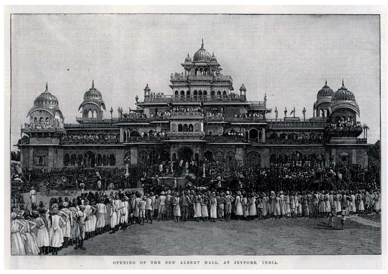
Plate 2.19 'Opening of the new Albert Hall, at Jaipur, India', engraving in The Illustrated London News , London, 24 November 1888. Private collection.

the training it offered differed somewhat from that provided by government art schools, which, he thought, over-emphasised drawing.