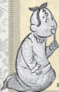
Illustrations © Brett Helquist

Answers: Across 1: reauhop; 2: minda; 4: ecrif; 6: fut; 7: fura; 8: chittol; 9: tretchev; 10: bax Down: 2: manco; 3: neebdes; 5: fut; 7: fura; 8: chittol; 9: tretchev; 10: bax