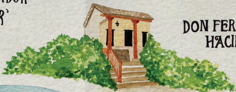
DON FERNANDO'S HACIENDA