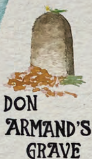
DON ARMAND'S GRAVE