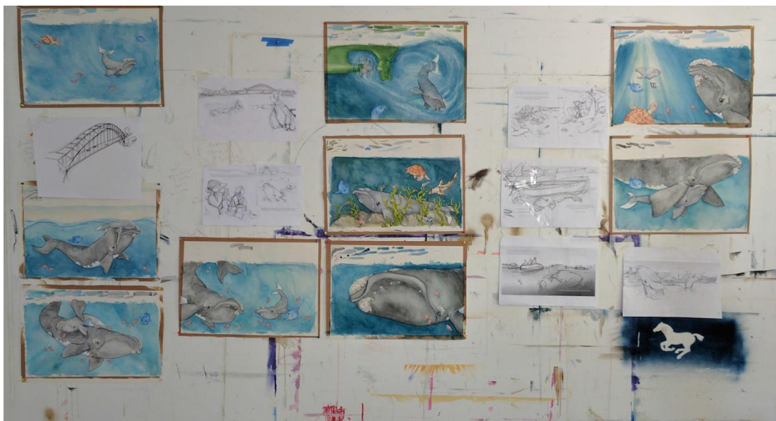
Studio wall with drafts