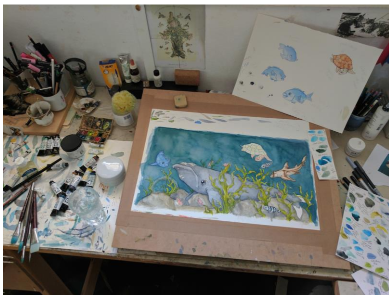
Desk and final artwork