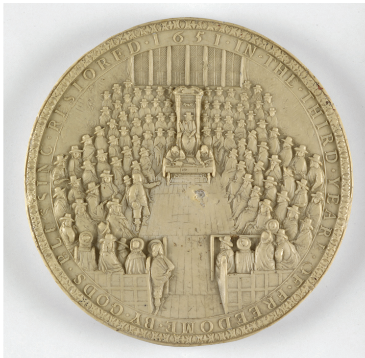
Above and front cover: The House of Commons in 1651, a cast of the obverse of the Second Great Seal of the Commonwealth, 1651. (Detached Seal XXXIX.17)