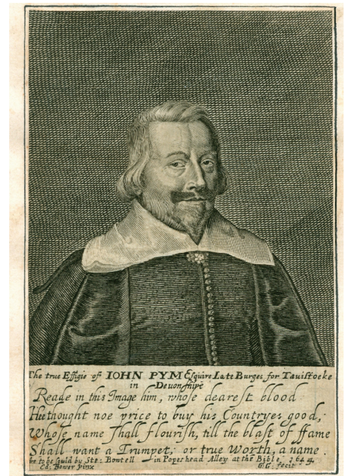
Above: John Pym, the parliamentary leader of the early years of the Long Parliament: engraving by George Glover, after Edward Bower, 1644