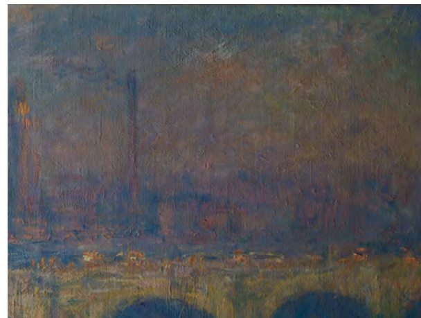
Raking light detail, upper right

Imaging and XRF analysis conducted by Carnegie in June 2017 suggests that Monet used a similar palette to the Chicago version, with the addition of cadmium yellow, chrome yellow, and chrome orange. The addition of yellows to the palette undoubtedly has to do with Monet's efforts to render sunlight. No pentimenti or other changes made by the artist were noted during the imaging process.